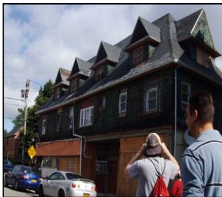
Starlight Artists taking pictures during the Buffalo walking tour.

The project was great! It was nice to talk to the participants about the Rumsey estate, for example, and show them that Buffalo history was literally right in Starlight's own backyard. I hope we can do it again next year!